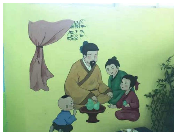
Figure 3 Emotional education

Many students are at a critical moment, during which their world outlook on life is easily influenced by various external factors. Although they have learned English before, they are in the early stages, or simply focus on skills training, but ignore the two factors of culture and emotion. The environment of the university is diverse, some students will develop anxiety in the process of English learning, so by cultivating students' literary and cultural literacy, they can strengthen their psychological quality and improve their personality. To some extent, literature is a collection of narration of a personal thing, which can help the reader to experience the change of the event, to arouse emotional resonance, and thus to give them courage to be able to face the difficulties and move forward constantly. No matter what the circumstances, literature can provide a very strong motivation for learners in the process of language learning, for example, in the psychological aspect, the reader cannot only enjoy the literature, but also can imagine the role of the simulation. Literature is to some extent a medium for learners to construct the whole world in their own minds through the ability of imagination, to sketch the faces of the characters with detail, and to place them all in a more special historical period to see the projection of their own shadow through their own reflection.