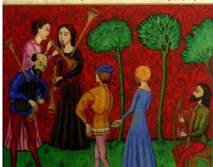
Figure 1 Chinese and western cultures